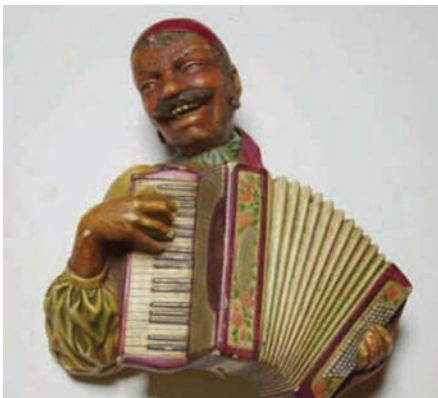
A ceramic figure given to the author in 1960. The image will be used on the cover of The Tango Touch .

Around the time I began to think about how to write for this issue of Review , Paul Keating's keynote address to the Sydney Film School appeared in The Weekend Australian (July 14–15, 2007: 29). In his colourful, self-aggrandizing manner, Keating defined himself as a "patriot" in contrast to John Howard, whom he described as following the dangerous and divisive philosophy of nationalism with its stock in trade of "jingoism, populism and exclusion of the most calculating kind". Keating referred to his own type of patriotism as inclusive, cosmopolitan, and traditional, and noted George Orwell's claim that "nationalism is a notion arising from the myth of a people, whereas patriotism is a belief in a particular place and its history". The blustering polemic must be read as such, but Keating's notion of belief in Australia as a place—the locus of a unique, richly diverse, inclusive and ever-unfolding "Australian" history—as opposed to belief in the singular myth of an "Australian" people seemed to resonate with some of the things I wanted to explain about the motivations for my current book project, The Tango Touch . I shall return to these resonances later.