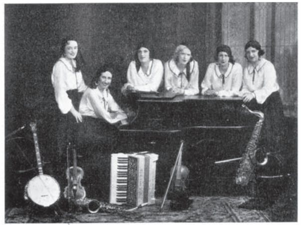
“ROMANY” LADIES TANGO BAND

The Rom stereotypes that became most influential and confusingly conflated in Australian popular entertainment were the Andalusian “Gypsy” (the well-known dark-flashing-eyed, flamenco-dancing, castinet-playing, hand-clapping and foot-stomping “Carmen” and the swarthier, brooding but handsome male dancer and fiery guitar-player); the romantic and virtuosic fiddle playing of the Hungarian Rom; and the melancholy and soulful vocal music of the Russian Rom. More important still was a generalised notion of the music of the Gypsy café and restaurant orchestras of “Old Vienna”, Budapest, Paris, Moscow and other major continental European cities, a model adopted by famous English “tango” or “Zigani” orchestra leaders like “Geraldo” (Gerald Bright) or “Alfredo” (Fred Gill) who, in turn, provided models—though not the only models—for tango or Gypsy-tango bands in Australia. The “Gypsy tango” concept also overlapped confusingly with other tango-related stereotypes adopted here, such as the “Argentino tango” bands, “Hungarian” and “Russian” Gypsy bands, “Gaucho-tango” bands, “League of Nations” (refugee) bands, “Rhumba” bands and “ Orquesta Tipica ”.