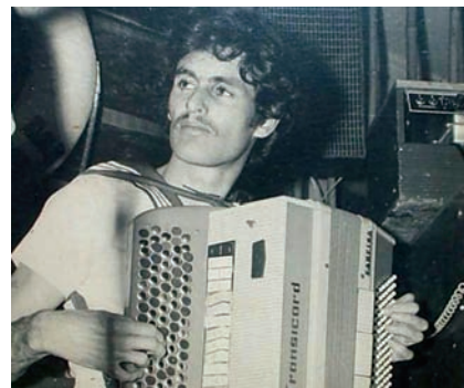
The author with the Dutch/German cabaret band, The Maharos , in 1967.

importation and transplantation of, and professional creative engagement with, popular Latin-American, Spanish and other Continental European music and dance before Latino mass migration, official multiculturalism and the so-called "world music" scene. The idea for the book originated from my encounters with "Latin" and "Continental" (also called "International") music in dockside bars, cabarets and dance halls in ports around the Mediterranean, South America and numerous other regions as an Australian teenager in the British merchant navy, and from travel around Europe by motor bike and other transport as someone with an obsessive interest in European accordion playing. It also came from later experience as an accordionist in Melbourne, playing in various so-called "Continental" nightclub bands of mixed ethnicity. Yet despite extensive world travel experience, having enough Mediterranean genes to be frequently mistaken as European by patrons, and being married into a Hungarian post-war migrant family for whom "Gypsy" music was the sound of home, my perspective on all of this was monocultural. It was that of an Anglo-Australian outsider, intrigued with the exotic "difference" of working in European-Australian combos and playing "Continental" listening, dancing and cabaret music, of which Latin-American and other Hispanic-related music was an integral element.