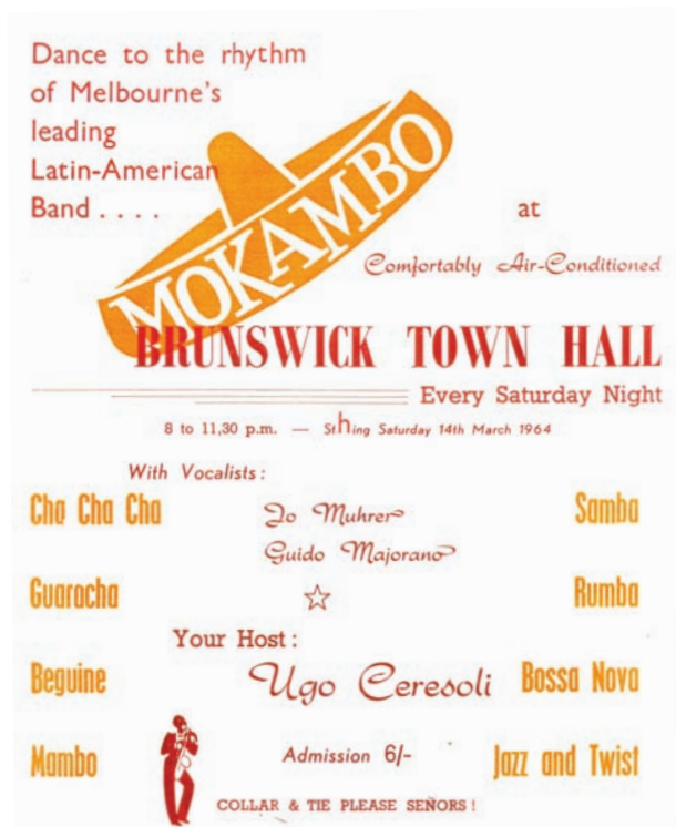
Poster for Ugo Ceresoli’s Orchestra Mokambo.