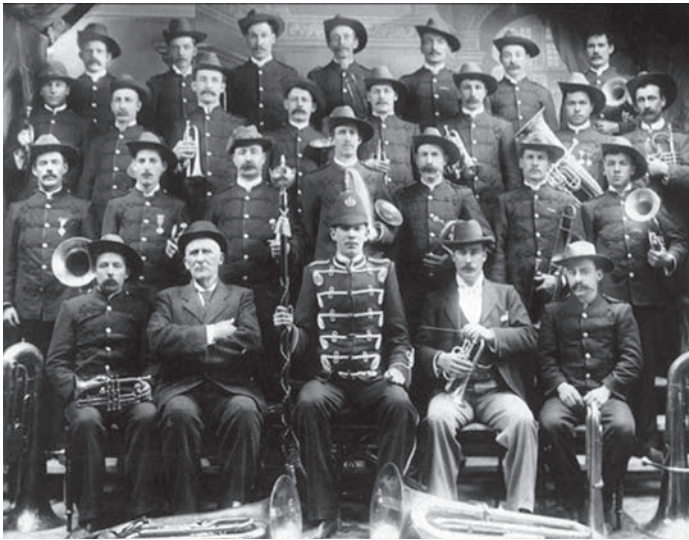
The Lord Nelson Miners' Band. Winners of the first South Street Band Contest 1900.